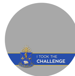
Facebook profile picture frame