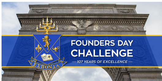
For any Facebook posts