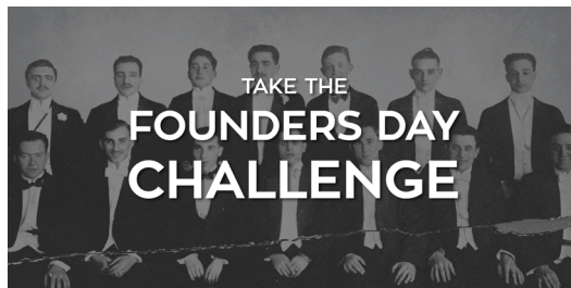
For Immortal Eleven Facebook posts