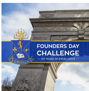
For any Instagram posts