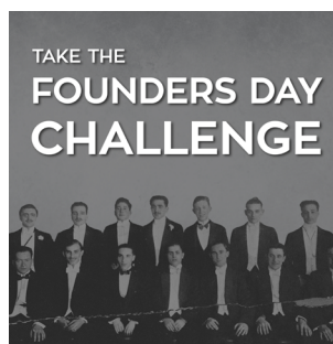
For Immortal Eleven Instagram Posts